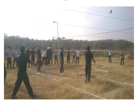
Volleyball Competition at Una