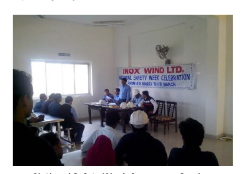
National Safety Week Awareness Session at Una

Being in the renewable energy industry, our concern for environment can never be over emphasized. Social and Environmental audit was conducted at our Dangri site by an external expert agency.