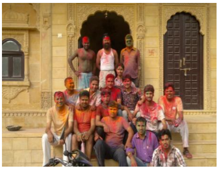
Colours of Holi at Jaisalmer