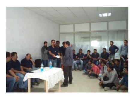
Attendance Appreciation Programme at Rohika

In Rohika plant, every quarter, team members with 100% attendance are recognized in a quarterly attendance appreciation programme.