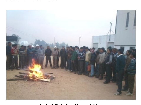
Lohri Celebration at Una

It is not only that we work together, the lnox Wind team across location and sites also celebrate together. Such celebration bring us close to each other and help in building a stronger team. Be it Lohri celebration, Vishvakrma Puja, we saw enthusiastic participation of all the team members in bringing our sites alive with chants and décor of festivities.