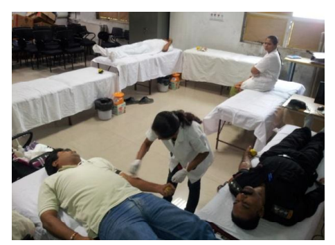
Blood Donation Camp at Rohika

The call for this social service saw a stupendous response from the employees and around 100 bottles of blood were donated. Each donor was given a Certificate and a Card. While expressing his gratitude, the Executive Secretary of Red Cross Society, Ahmedabad said that the collected blood will be used for treatment of children suffering from Thalassemia.