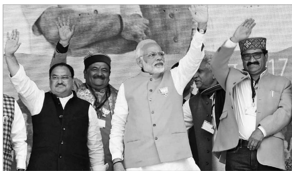
Prime Minister Narendra Modi and Health Minister JP Nadda at an election rally in Kullu on Sunday

Modi, who addressed the Parivartan Rally in Una, Palampur and Kullu to give a fillip to the BJP's poll campaign, accused former prime minister Indira Gandhi of not going for a note ban when she needed to, and said he would not have had to carry out this elaborate exercise had she taken the step for demonetisation years ago. The PM alleged,